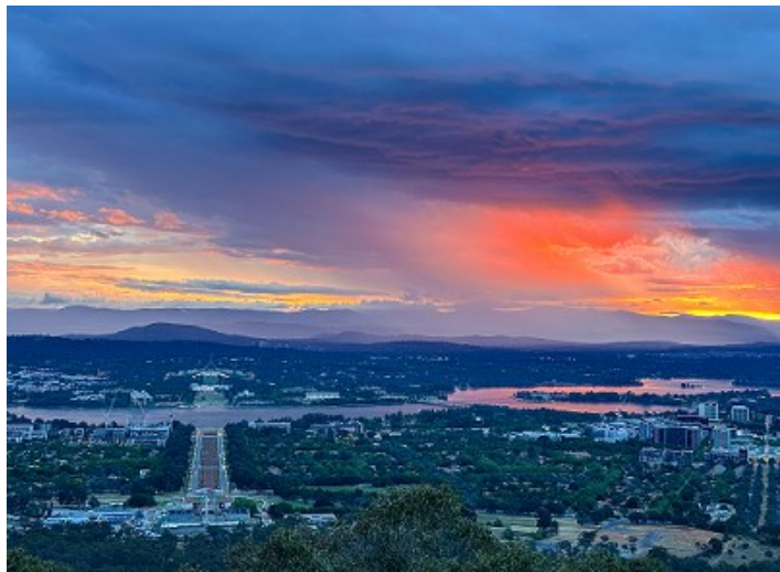
Storm clouds over Canberra

Hotel Realm, 18 National Circuit, Barton, ACT